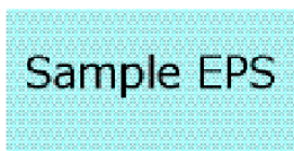
EPS with preview image